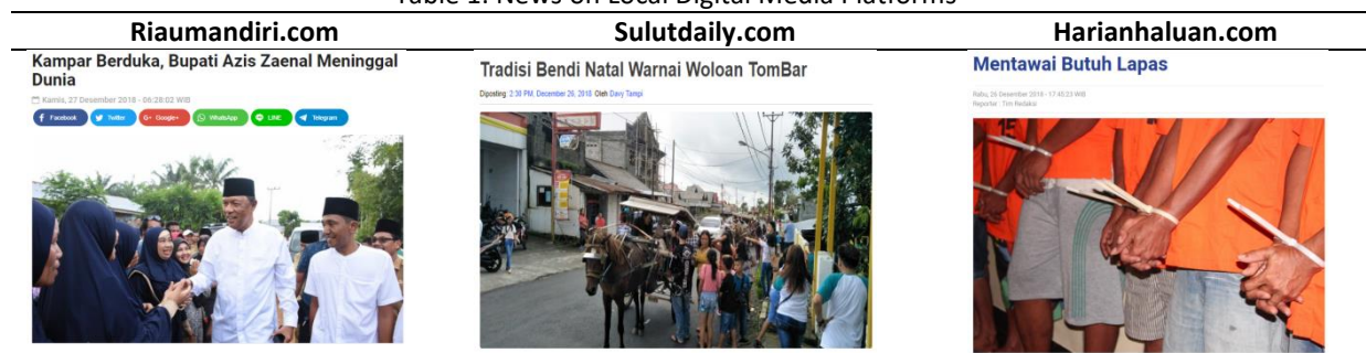
Table 1: News on Local Digital Media Platforms

In this context, the presence of local media platforms in all regions provides more rooms for a local news broadcast. This could minimize the Jakarta-centered or national news reporting, thus serving as a manifestation of diversity of contents. With an increasing number of digital media, diversity of ownership hopefully will also emerge. However, ownership centred on several parties is still an unavoidable classic issue, including in digital media platforms.