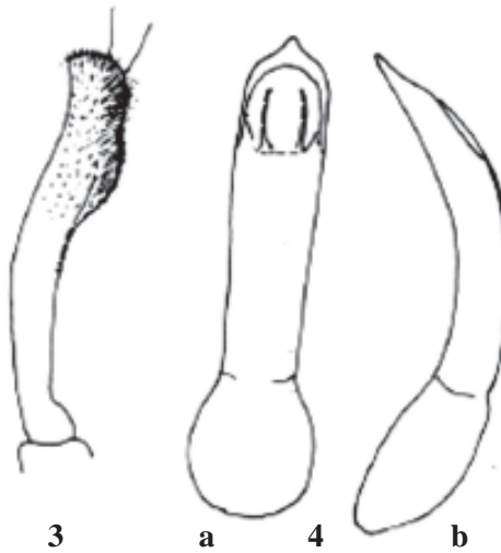
Figs. 3-4 Simaethea sarawakensis Mohamedsaid, new species (male). 3, protibia, 4, aedeagus: a) ventral view, b) lateral view.