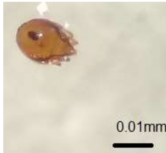
Figure 2. Schelorbates sp. infested anuran host, Duttaphrynus melanostictus in the urban area of Kota Samarahan, Sarawak

attached on the body of four individuals of anuran, D. melanostictus with a total of four individuals (Table 1). Meanwhile, the other anuran species were not found to be infested by neither the parasitic nor the non-parasitic microarthropods.