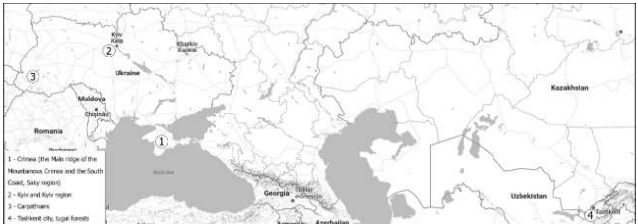
Figure 1. Locations of the study