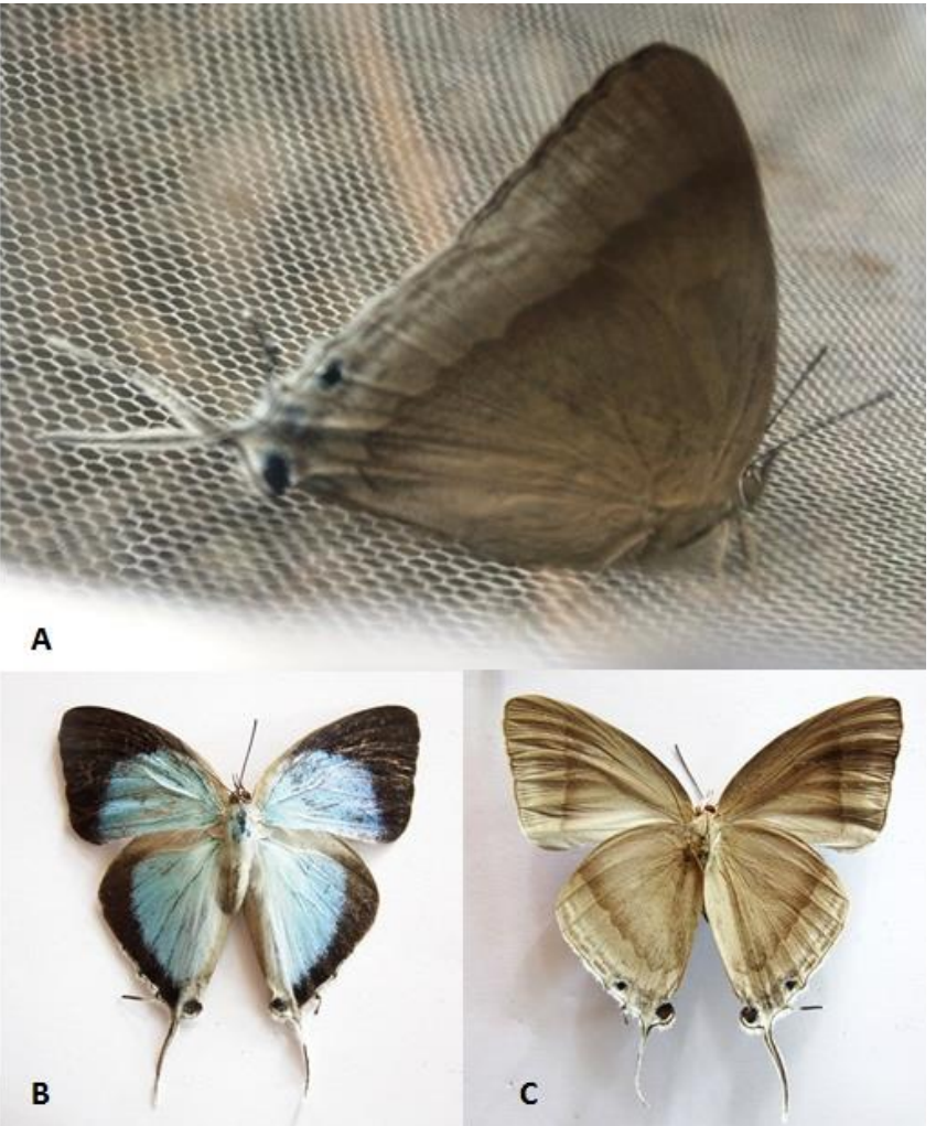
Figure 2. Specimens of P. gigantea ; (a) life specimen, (b) dorsal view of preserved specimen, (c) ventral view of preserved specimen