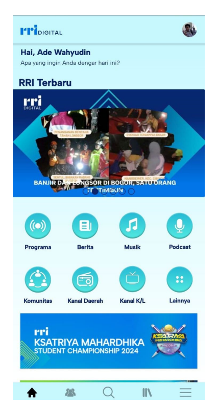
Figure 1: Display of the RRI Digital mobile application

Harnessing the strength of credibility and trust, RRI can form partnerships with various youth communities, such as independent music communities or other creative entities. Such collaborations can yield content more aligned with the younger generation's interests. This enables the younger generation to participate in programs like online discussions, direct queries to broadcasters, or polls on topics of interest to them.