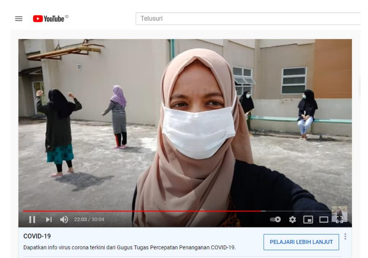
Figure 1: Communicative Act of Patients during Isolation and Research Informants

The communicative act taken by COVID-19 patients is the same, namely self-isolation. Isolation can be interpreted as limiting interaction with other people, including family. There is the application of distance in communication. Communication distance not only reflects relationships, but also represents situations where it is not possible to be physically close, such as experiencing a contagious illness (Ghosh et al., 2020; Nwoga et al., 2020). Likewise, with the COVID-19 situation, people are asked to refrain from making direct contact or communication, especially with COVID patients. Maintaining physical distance is also practised by COVID patients during isolation. Even though they are doing activities such as sports together, patients still pay attention to the distance when interacting. This condition was also acknowledged by one informant from Padang City, West Sumatra Province, as illustrated in Figure 1.