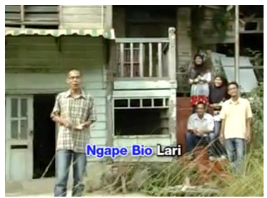
Figure 4: A screenshot of a music video of the song of Ngape Bio Semok with a background of abandoned old house

appeared in Western-style collar shirts with jeans, meanwhile, female singers wore modern-style Muslim headscarves, modern-style dresses and trousers.