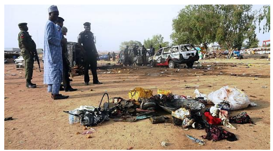
Figure 1: Nigerian Police bomb experts inspect the scene of a suicide bomb attack

Therefore, even though the Boko Haram's ideological prohibition of Western education and Western values were premised on so-called Islamic doctrine, by all means, they are fundamentally rooted in the British colonialists' alteration of the nation's ethnic relationships and political structure. In a nut shell, colonialism can be the root cause of the present breed of faith-based or religious terrorism raging across the world, especially in Sub-Saharan Africa, the Middle East and North Africa (MENA) and South Asia. So, there has been collision between the social, cultural, political and economic values imported by colonial masters and the indigenous ones; thus, over the decades they ultimately breed militancy and terrorism (Abdulazeez, 2016; Barkindo, 2013; Khawaja, 2010; Onyeniyi, 2010).