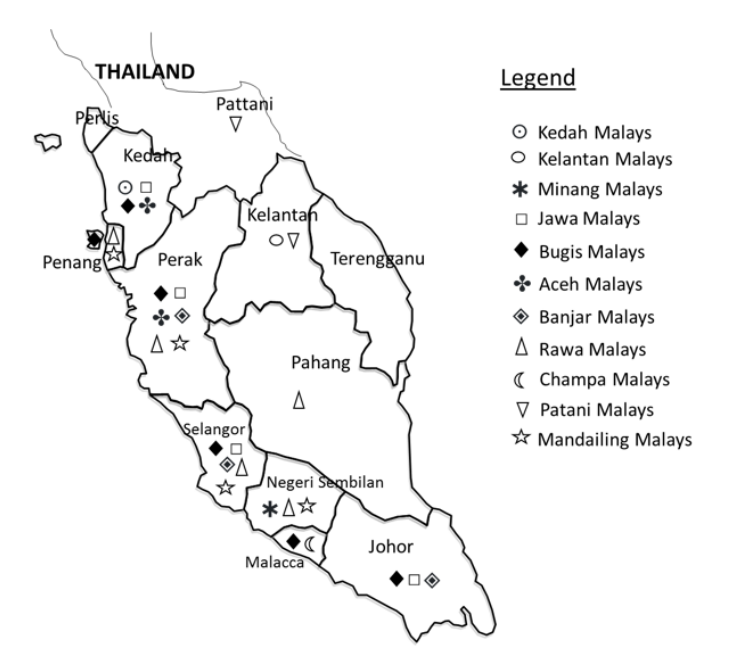
Figure 3.Settlement and distributions of Malay subethnic groups in Peninsular Malaysia