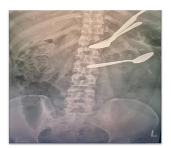
FIGURE 1: The abdominal radiograph showed four spoons

The patient was resuscitated in the Emergency Room with intravenous crystalline fluid and antibiotics. An immediate diagnostic oesophago-gastroduodenoscopy (OGDS) procedure was performed with the intention of retrieving the spoons. Three of the spoons were successfully retrieved by using snare polypectomy forceps. There were no immediate complications.