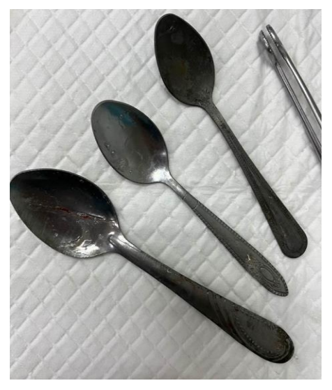
FIGURE 3: Three spoons were successfully retrieved via endoscopy