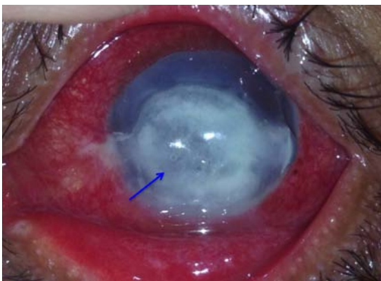
Figure 2: Day 2 postoperative image showing cyanoacrylate glue and bandage contact lens in situ.

temporarily after the debridement of surrounding stromal abscess as shown in Figure 2. Operative procedure ended with the application of bandage contact lens over the left eye.