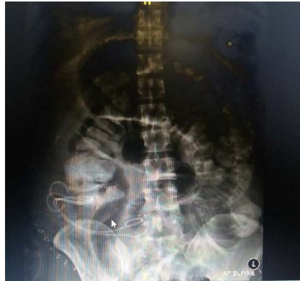
Figure 1: Abdominal X-ray in adult Hirschsprung's disease

Surgical management of HD is very effective with satisfactory long-term results and quality of life. Different types of the corrective surgical procedures for HD had been suggested such as Swenson, Duhamel, Soave, and Lynn procedures. Besides, some surgeons suggest performing low anterior or ultralow anterior resection. A few corrective surgical procedures developed to treat the children have been applied to adults, but not all procedure is suitable for adult. Lynn procedure for posterior anorectal myectomy was advocated earlier as an approach or complement approach to short segment HD because of low morbidity and minimal technical difficulty. The