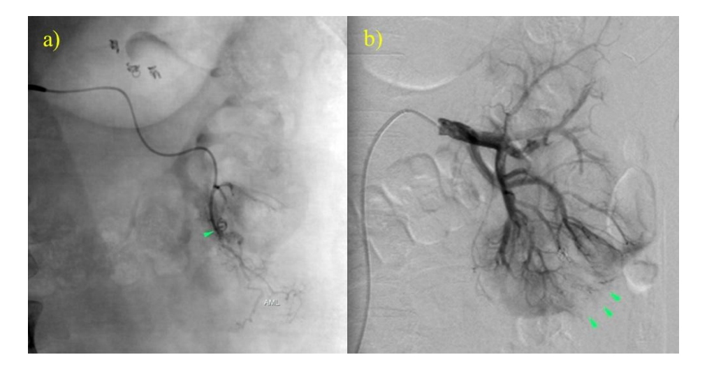
Figure 2 : a) Selective embolization was performed via a microcatheter, with its tip placed distally in the tumour arterial feeders (arrowhead) b) Post-intervention angiogram image showing markedly reduced lower pole AML vascular beds. More than 90 percent of tumour vascular supply was occluded (arrowheads).