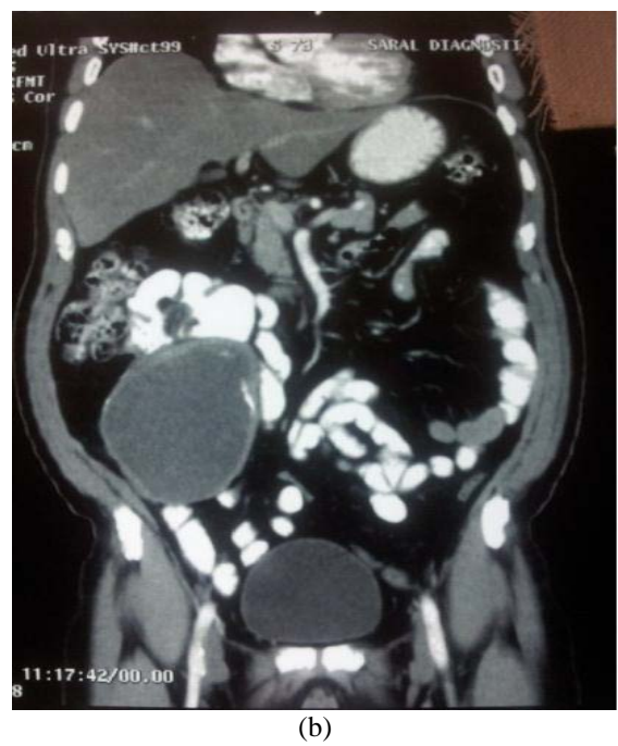
Figure 1 (a) and (b): CECT shows a homogenous cystic mass with well defined margins and thickened margins at some places, presence of calcification and central necrosis and no organomegaly or presence of free fluid in the peritoneal cavity, suggestive of lymphangioma, hydatid cyst, mesenteric cyst.

view of the tumor size more than 2 cm (10 cm in this case) and involvement of mesoappendix and the baseof the appendix, right hemicolectomy was done in this case. The patient was discharged on post-operative day 6 in satisfactory condition.