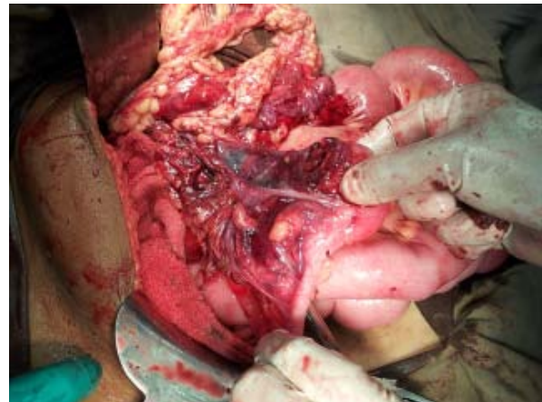
Figure 2: The cut end of gangrenous colon showing hematoma at the caecum.

There are many causes for fecal impaction including inadequate fiber and hydration, spinal cord injury, aging. Drugs causing impaired gastrointestinal motility include opiate analgesics, anticholinergic agents, calcium channel blockers, antacids, and iron preparations (3). Laxative abuse, paradoxically, is associated with constipation and faecal impaction. The affected individual is unable to produce a normal response to the distention of colon and progressively needs higher doses for achieving a bowel movement (6). Apart from pharmacological causes, congenital and acquired conditions of the colon, including