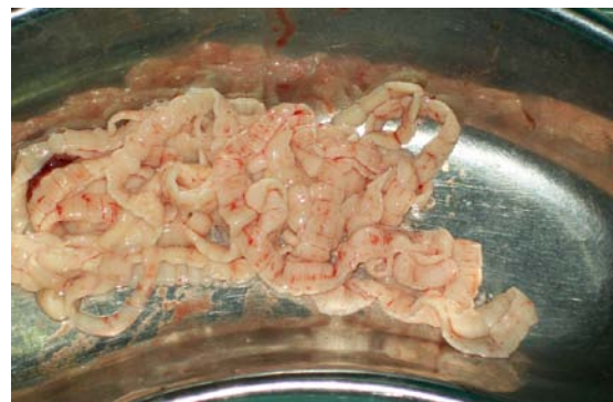
Figure 2: The tape-worm after extraction from the ileum.

The macroscopic picture of the small bowel perforation in our case could not be distinguished from other common causes of perforation such as typhoid fever, which undoubtedly represents the most common cause of small bowel perforation worldwide (8). Supportive evidence of this synergy between typhoid and tape worm infestation are the short duration of illness and positive blood culture sent preoperatively for Salmonella typhi . Synergistic Typhoid and Taeniasis perforation probably follows ischemia from pressure by the mass of worms in the small intestine (9). Taenia Solium may worsen typhoid enteritis by converting imminent to real perforations. Synergistic taenia infestation may lead to earlier intestinal perforation and accelerated clinical presentation in typhoid enteritis. These two tropical diseases affecting