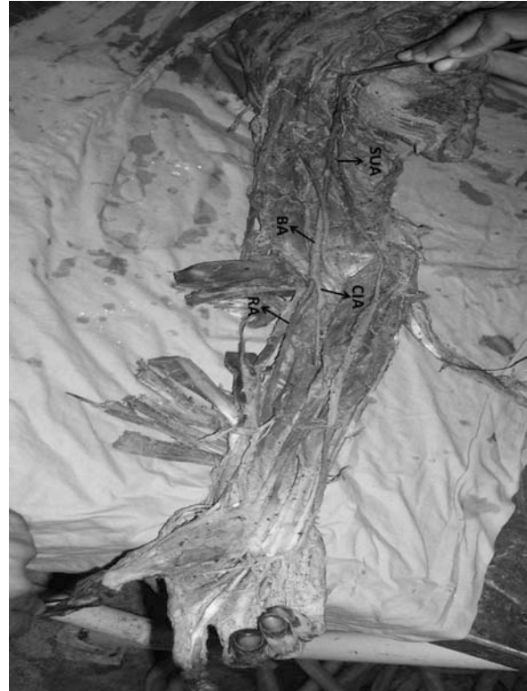
Figure 1: Showing the high origin of superficial ulnar artery. SUA: Superficial Ulnar artery; BA: Brachial artery; RA: Radial artery; CIA: Common Interosseous Artery.

In our present case this abnormal branch is termed as superficial ulnar artery. Nakatani et al. reported the incidence of superficial ulnar artery 0.6% to 9.4% (5). Cuneyt bozer et al reported the high origin of superficial ulnar artery from the brachial artery in the arm (6). KMR Bhat et al. reported high origin of superficial ulnar artery from brachial artery (7). Rodriguez- niedenfuhr et al. proposed possible embryological explanations of this kind of anomalies. The normal arterial pattern of upper limb is developed by selective enlargement or regression of capillary plexus not from the axial trunk (8). According to Baeza et al. , Singer et al normally there is superficial and deep parts of capillary plexus, due to haemodynamic forces the superficial part of plexus undergo regression deep part of the plexus persist as radial and ulnar arteries. Due to alteration in the haemodynamics sometimes the deep part of the