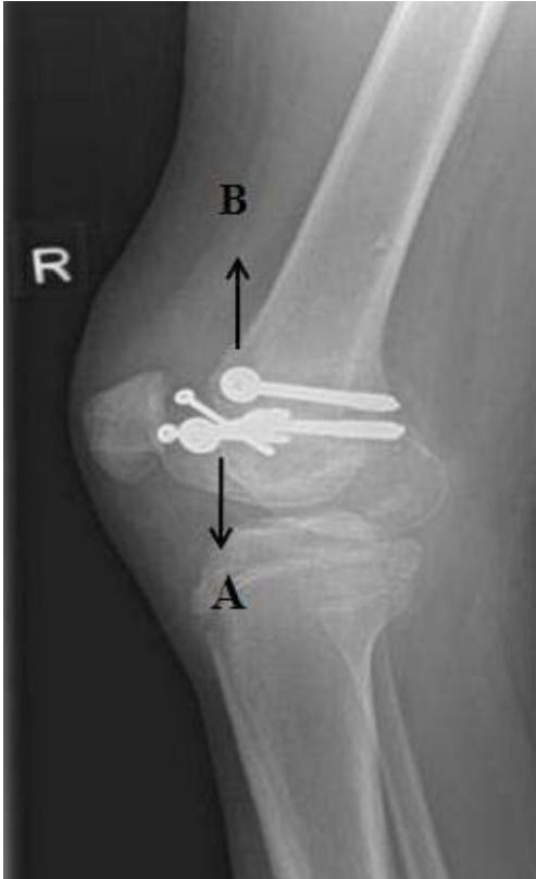
Figure 2: Radiograph of Right Knee Shows Cannulated screw fixation for femoral condylar fracture. A-Condylar fracture, B- Cannulated screws

arthroscopic knee release (lateral) with removal of screws performed and immediately after the procedure, Continuous passive motion (CPM) device set for motion from 0-45 degrees was recommended. One week after the procedure the boy was then allowed for ambulation with crutches with instructions to maintain non-weight bearing status. Outpatient physiotherapy was prescribed to manage the arthrofibrosis conservatively. Post-operative physiotherapy assessment findings following arthroscopic knee release and MUA indicated mild effusion, moderate pain, and consistent knee joint range of motion limitation with significant quadriceps muscle weakness, ligamentous instability, medial side (knee) numbness and thick scar running over the anterior aspect of the right-side knee (Table 1).