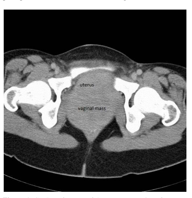
Figure 1: CT Scan features of the mass suggestive of cervical mass

Clinical diagnosis of vaginal leiomyoma requires vaginal and rectal examination to differentiate prolapse from cervical, uterine or vaginal masses.