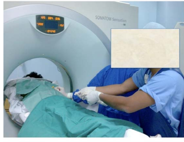
Fig 1: The positioning of patient and puncture of inferior vena cava done under CT guidance.

under fluoroscopic guidance with the tip placed in the inferior vena cava. The sheath was then peeled apart and removed slowly. Check inferior venacavography was performed to confirm the tip position and flow.