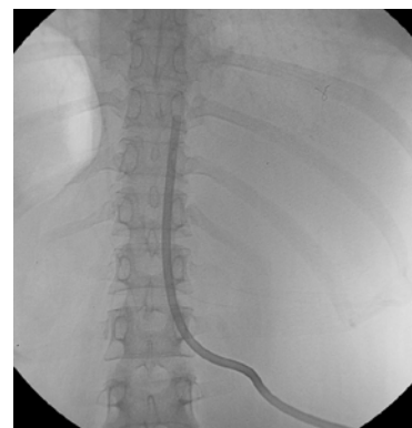
Fig 3: The tip of the dual-lumen catheter placed in the upper inferior vena cava.

Access to the central venous circulation for hemodialysis has traditionally been performed via the