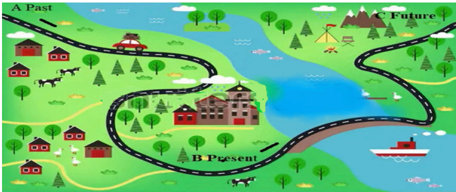
FIGURE 1. Analogy of dream with a person travelling from position A to C

Among humans, plants and animals, sleep is the state of inactivity and break from functioning of the nervous system, whereas other processes such as blood circulation, growth and digestion carry on at an altered speed (Rahman 1964). In slumber, the conscious mental activity halts, but in dreams the gifted people visualize spiritual realities, either events happened already or events in the future that would have otherwise been not possible in the normal situations. Ancient Greek biographer, Plutarch, has suggested that spiritual truths convert into signs in dreams by particular laws of motion that control the instants of these images. Another opinion is that of Ghulam Jillani Burq (1997) who explains that in dream, the person’s soul attains an elevation of spiritual presence wherefrom they can distinctly visualize events occurred in past or an event of future. He describes this fact with the assistance of the following figure: