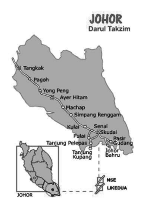
FIGURE 1. Map of PLUS' North-South Expressway Exits in Johor Region

The North-South Expressway connects Peninsula Malaysia from Skudai, Johor in the south to Bukit Kayu Hitam, Kedah in the north for about 807 km. The North-South Expressway comprises of nine toll stations in the closed system and 2 toll stations in the open system. Three sampling sites along the closed system of North-South Expressway in Johor were chosen namely Ayer Hitam toll station, Skudai toll station and Tangkak toll station as shown in figure 1.