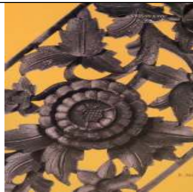
vii Motif Melayu daun hidup (kelopak hidup)