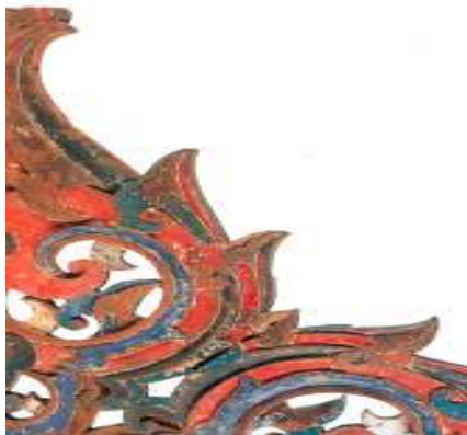
vi Motif bunga Melayu tua (kelopak maya)

vii Motif Melayu daun hidup (kelopak hidup)