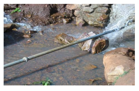
Fig.3. A pipe carries clean water from the source to a collecting point that is easily accessible for community members