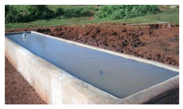
Fig.4. Livestock now access clean water from a trough

Expansion and development of a cooperative income-generating project. The women of Umoja make and market traditional Samburu beadwork to help support their families. Profits are invested in a communal sickness and disability fund that enables the women to protect one another through hard times. A plan to strengthen local capacities by providing trainings in the administration of the water system and the management of natural resources. Support to begin a transition from herding cattle to raising camels, which require less water (http://www.madre.org/index.php?s=2&b=20&p=51).