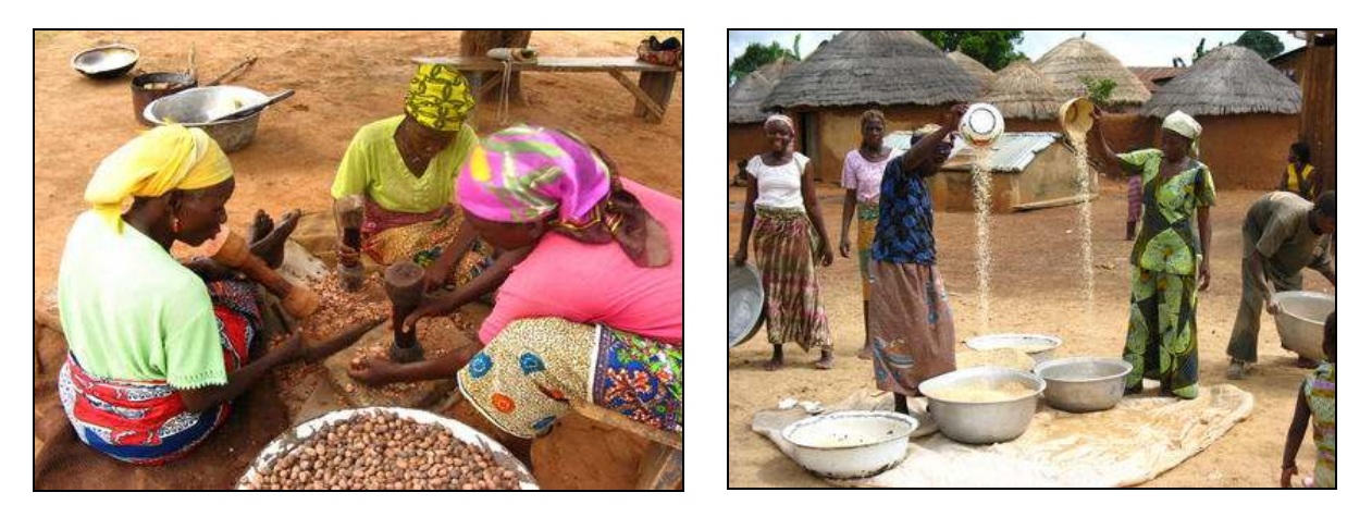
Figs. 2. & 3. Some of the women participants in the KADA micro-loan economic projects