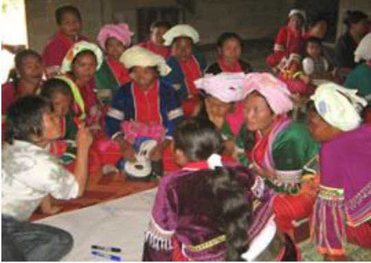
Fig. 6. The women of Suan Cha Palaung village involved in long-range community planning