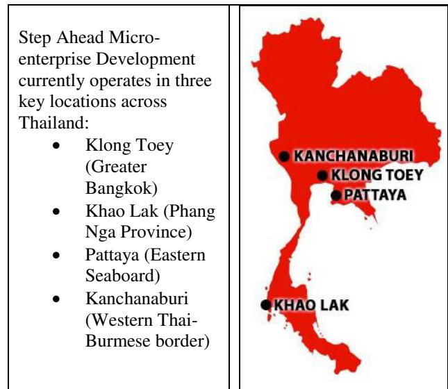
Fig. 3. Step's Project locations

Project design: The vision is to see comprehensive transformation that demonstrates the love of God in action among poor individuals, families, and communities in Thailand. The mission is to amalgamate micro-finance, mentoring, community economic development, and capacity building into an integrated service that powerfully displays the love of God while actively developing and empowering the poor, the vulnerable, and the marginalized.