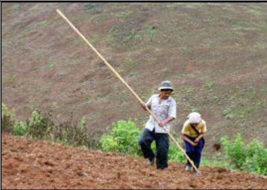
Fig. 4. Hilltribe communities with limited farmland face challenges in producing upland rice, their staple crop

Among the hilltribes of the Golden Triangle, many of the marginalized struggle against poverty, lack of citizenship and related rights as well as the loss of access to natural resources which result in (1) small, degraded hill fields that barely support adequate yields of food and cash crops needed for subsistence; (2) meager livestock production as a result of prevalent livestock diseases and less available food sources, little or no access to clean, plentiful water and sanitation; (3) lack of citizenship or other legal residence as well as accompanying rights including land tenure; (4) vulnerability to danger such as fires, seasonal hunger, drought and cold conditions during the winter; (5) decreasing access to traditional food, medicines and building materials from the forests; and (6) the need for supplemental income as farm self-sufficiency has diminished due to limited land resources ( http://www.uhdp.org/Condition.html ).