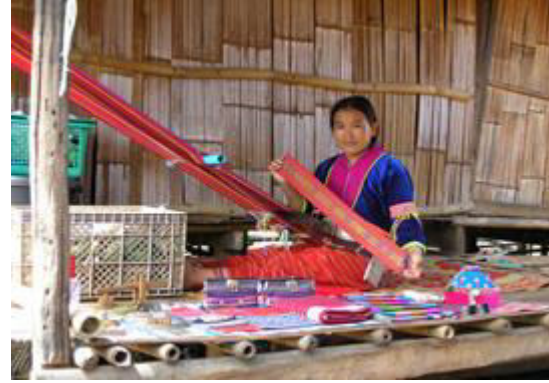
Fig. 7. Tribal handicrafts supplement family incomes in several UHDP focus communities