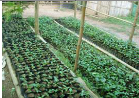
Fig. 8. Backyard seedling nurseries produce plants for family farms or for local markets