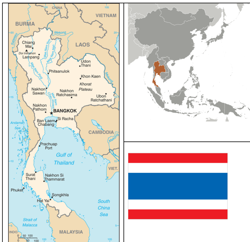
Fig. 1. Location of study

Thailand since 2005 has experienced several rounds of political turmoil including a military coup in 2006, 2008, 2009, and 2010. In 2011 former prime minister Thaksin's sister, Yingluck Chinnawat, led the Puea Thai Party to an electoral win and assumed control of the government. A blanket amnesty bill for individuals involved in street protests, altered at the last minute to include all political crimes - including all convictions against Thaksin - triggered months of large-scale anti-government protests in Bangkok beginning in November 2013. In May 2014 Yingluck was removed from office by the Constitutional Court and in late May 2014 the Royal Thai Army staged a coup against the caretaker government. The head of the Royal Thai Army, Gen. Prayut Chan-ocha, was appointed prime minister in August 2014. The interim military government created several interim institutions to promote reform and draft a new constitution. Elections are tentatively set for early 2016. Thailand has also experienced violence associated with the ethno-nationalist insurgency in its southern Malay-Muslim majority provinces. Since January 2004, thousands have been killed and wounded in the insurgency (CIA, 2015).