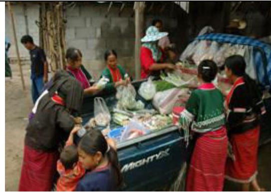
Fig. 5. Once self-sufficient, landless upland communities now rely on food purchased from outsiders

As in many cultures, the relegation of gender roles in hilltribe society can limit the participation of women in certain capacities, such as in direct forms of community leadership. UHDP is partnering with upland communities to broaden gender understanding and to strengthen the participation of women in all levels of society ( http://www.uhdp.org/Response.html ).