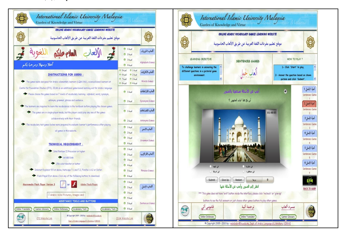
Figure 3: Samples of screenshot of online Arabic vocabulary learning games prototype

This game-based learning prototype allows lecturers and students access to additional Arabic language learning aid, in a gaming application, complementing the traditional learning methods. It facilitates vocabulary enhancement through a compendium and variety of games (34 games) in the on-line environment and supported with open sources of connected dictionary, online translator and game's glossary (in English and Arabic). The prototype provides a new learning experience for students who have been through a traditional Arabic teaching and learning methods, by immersing into the attractive, interesting and interactive game-based learning environment.