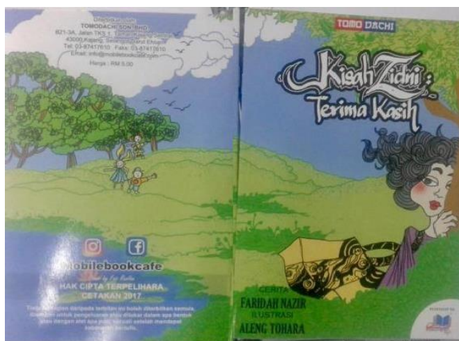
Figure 1. Zidni Activity and Coloring Book