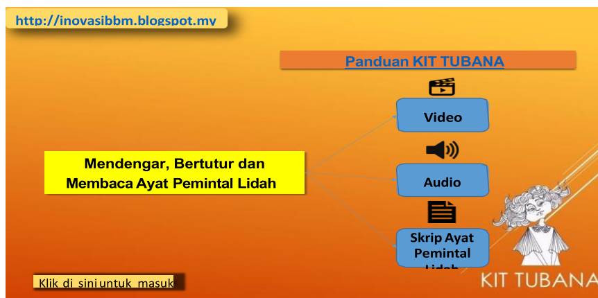
Figure 2. Tubana Kit Tongue Twister Training Software