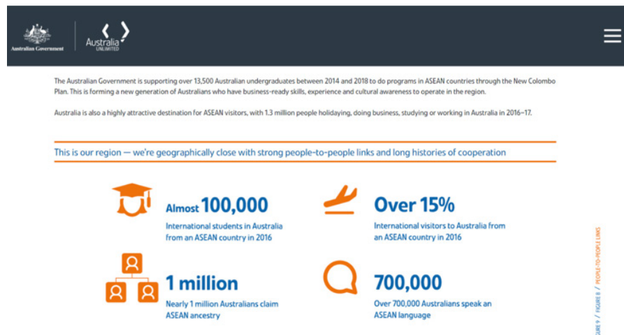
FIGURE 4. Australian Demographic Data

many Australian students to skip ASEAN as the destination of choice due to preconceive idea of ASEAN and what it can offer. The lack of interest for the Australian student from these backgrounds to come to ASEAN can also be contributed to the type of mobility programme offered. A short term niched based programme to ASEAN is more likely to gain response in comparison to a full semester exchange program.