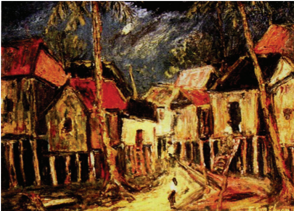
FIGURE 2. Foo Syn Choon: Evening in Malay Village, oil paint. 1964. Size 29.7x42cm. Source: Sarawak Museum Collection.