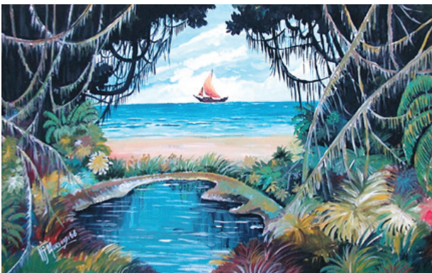
FIGURE 3. Murshidi Nambi: Belukar di Tepi Pantai, oil paint. 1966. 88cm x 58cm.

Despite early exposure on artistic education received in Sabah and Sarawak, teachers from Brunei remained anonymous because of their small scale activity after the war, due to the difficulties of gaining art materials from local market (Abdul Gani, 2001). Thus, their works were not many and early works detected were in sketches of graphic illustration mainly for local publication and daily newspaper. None of the sketches and drawings by skillful artists were documented resulting in difficulty on pin-pointing their starting point. As a result, the commencement of artistic activities in Brunei documented from where formal art education was attained by the first batch of art students in the early 70s.