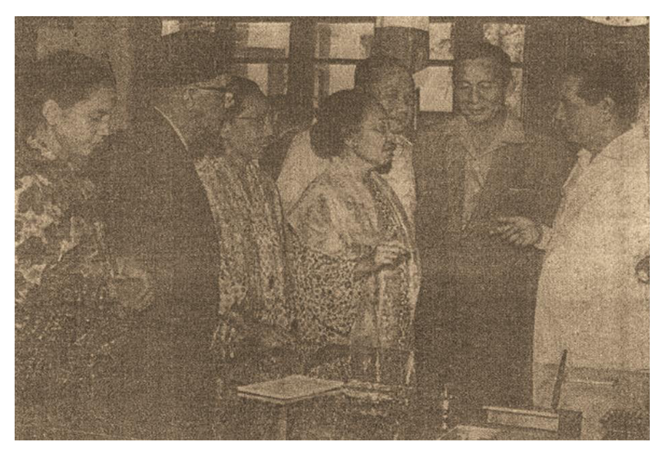
FIGURE 2: A Delegation of Sulu Royal Families Headed by Sultan Esmail Kiram Visited President Macapagal on April 25, 1962.

Macapagal until President Ferdinand Marcos collaborated and dealt with the heirs of Sultan of Sulu, illustrates that the Sultanate of Sulu still had silent and subtle power.