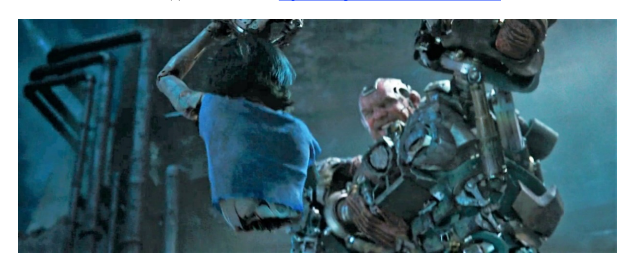
FIGURE 7. Abjectified Alita

Numerous transformations of her body significantly show how Alita challenges conventional gender representations and redefines boundaries. Initially, Grewishka tears Alita's body into pieces (as shown in Figure 6), and this process of distortion and deformity completes her cycle of Abjection. This transformation does not present an image of Alita as a powerful, athletic female fighting machine; instead, it portrays her as an immature and vulnerable fighter. Her vulnerability comes full circle during her battle with Grewishka, who possesses a large and muscular masculine body with imposing jaws (as shown in Figure 7). In fighting with him, Alita appears more like a child struggling to maintain her physical form.