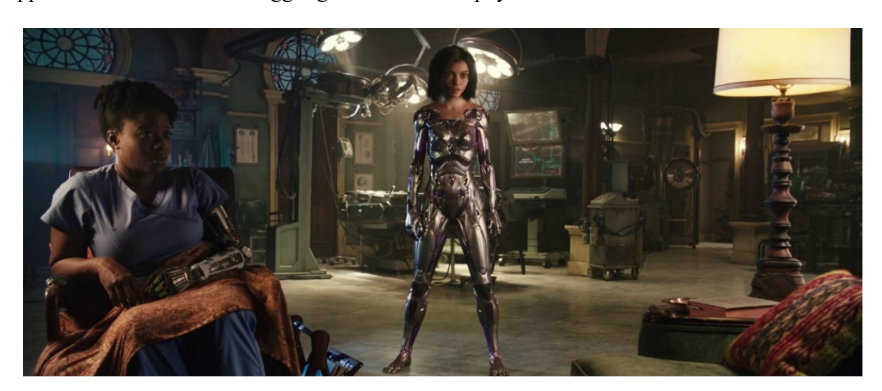
FIGURE 8. Alita in her new suit

Numerous transformations of her body significantly show how Alita challenges conventional gender representations and redefines boundaries. Initially, Grewishka tears Alita's body into pieces (as shown in Figure 6), and this process of distortion and deformity completes her cycle of Abjection. This transformation does not present an image of Alita as a powerful, athletic female fighting machine; instead, it portrays her as an immature and vulnerable fighter. Her vulnerability comes full circle during her battle with Grewishka, who possesses a large and muscular masculine body with imposing jaws (as shown in Figure 7). In fighting with him, Alita appears more like a child struggling to maintain her physical form.