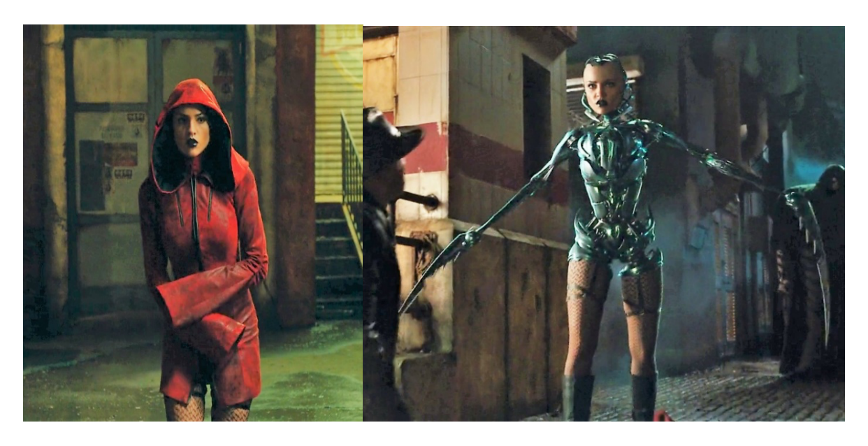
FIGURE 9. Nyssiana in human and dehumanised forms