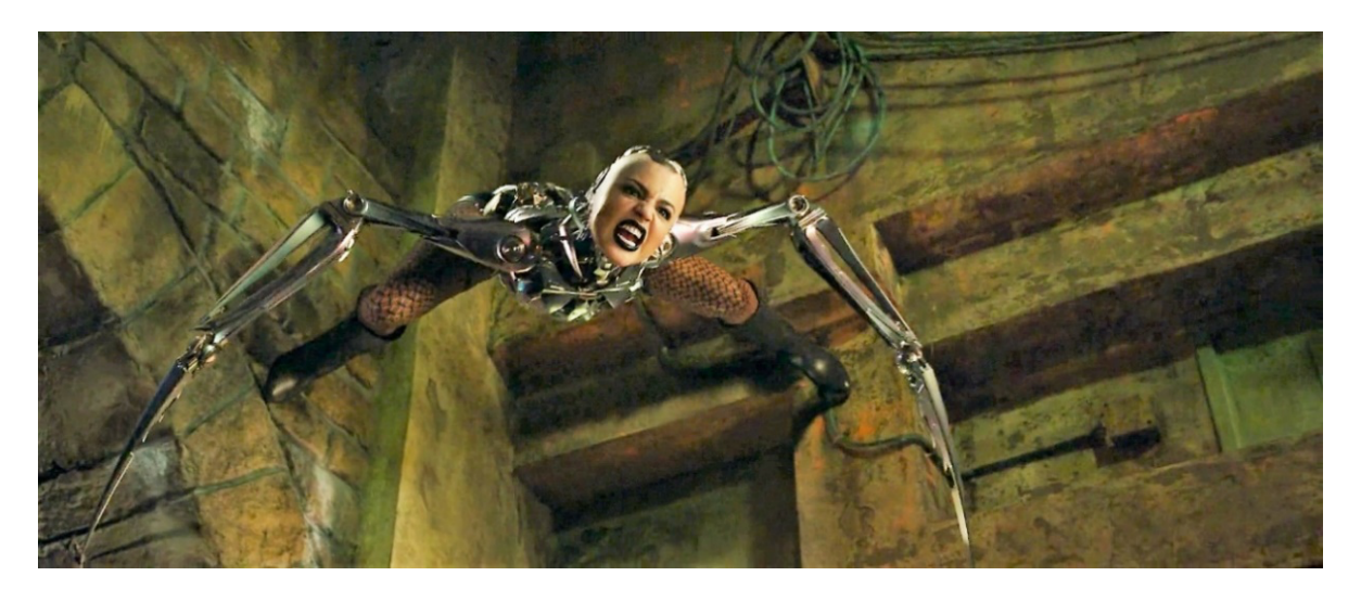
FIGURE 10. Nyssiana as an Object of Abjection

This initial visual scene makes Nyssiana an unsettling creature with double identities and forms. It becomes difficult to perceive her as a stable social subject. This not only underscores the influence of technology on the construction of gender norms but also alters her impact on the audience.