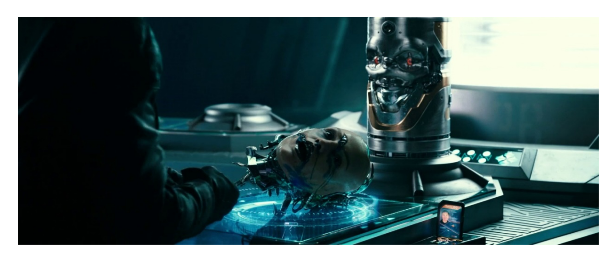
FIGURE 12. Nyssiana's Face as a Commodity Exchange

Nyssiana's head is shown in the hands of Ido, who is placing it on the machine that will earn him points to increase his rank among cyborg fighters. This portrayal positions women, in general, and Nyssiana, in particular, as commodities that can be exchanged for bonuses, sustaining their lives in this age of technology. Depicting women as objects of exchange in the form of commodities aligns with patriarchal capitalism, where women are reduced to the bare minimum, alternating between their status as subjects and objects. Artificial intelligence plays a significant role in creating cyborg female characters, blurring the boundaries of gender and deconstructing them into their basic components. Female characters like Alita and Nyssiana are not entirely depicted as human or purely robots, but they appear as monstrous and emasculated constructs.