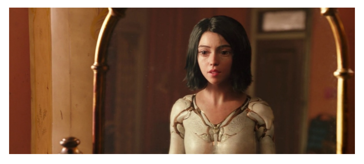
FIGURE 4. Alita in a mirror with an abject structure of a body and face

In this context, these characters exemplify a complex interplay of identities, showcasing how Alita oscillates between being a dehumanised abject creature and a warrior determined to secure her freedom and autonomy. Alita's journey from the junkyard to a laboratory and the pivotal moment when she confronts herself before a mirror highlight her interactions and negotiations with various forms of Abjection. She transitions from an unconscious object to a newly emerging conscious subject. However, as the narrative unfolds, the critical question remains: How will Alita utilise her warrior-like stature to challenge gender norms and combat the abuse of power and technology? Will her newfound strength empower her, or could it potentially further alienate and subject her to additional Abjection as her journey continues? These questions underscore the complexity of Alita's character development and the intricate dynamics of Abjection within the film.