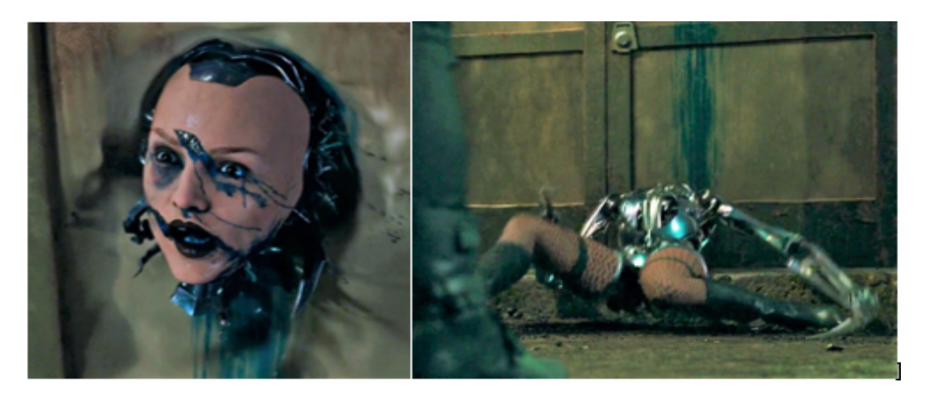
FIGURE 11. Abjectified Nyssiana - Dehumanised face and body

Thus, Nyssiana, initially depicted as an abominable spider, first evokes a sensation of loathing and ultimately represents a radical other that must be terminated for the sake of social cohesion and stability.