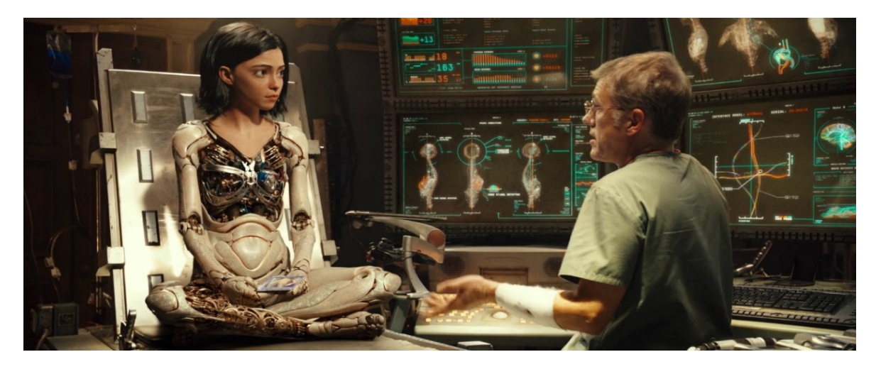
FIGURE 5. Alita and Ido gazing at each other

Alita is designed and projected to resemble a female machine, fulfilling a stereotyped feminine role under the guidance of Dr. Ido (as depicted in Figure 5). Alita has only one "parent"; she is created by Ido, who provided his daughter's body for her. Ido does not instruct her on how to behave in specific situations because she is already programmed to be a fighter through artificial intelligence. Ido, however, is not conscious of this fact. This lack of awareness allows Ido to