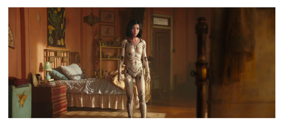
FIGURE 3. Alita with the face of an angel and the body of a warrior