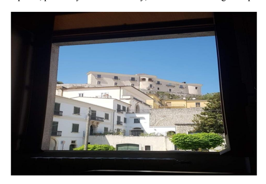
FIGURE 2. Gesualdo / Italy / April 27, 2020 / 1:41pm

Another photo, posted by a viewer in Italy, tells another message of optimism: