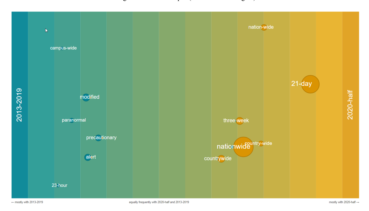
FIGURE 4. Collocates of lockdown in two subcorpora of Timestamped JSI web corpus