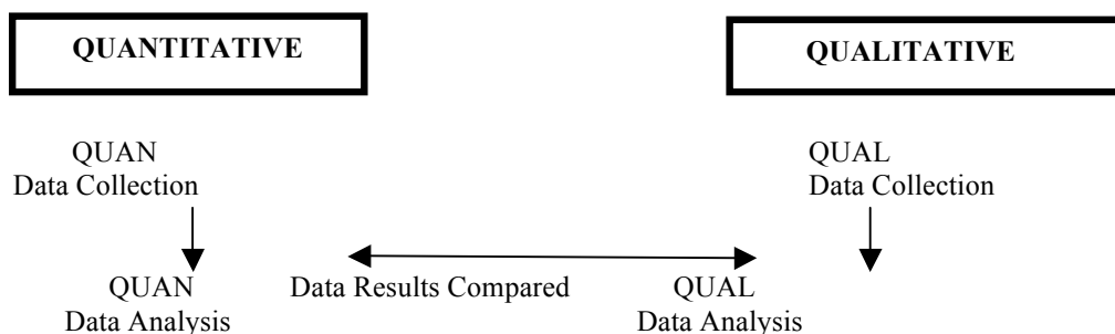
FIGURE 1. Concurrent triangulation design (Creswell 2009, p. 210)

A mixed-methods design was employed in this study. It is defined as a mixture of qualitative and quantitative methods and a procedure of accumulating both types of data within a single research (Creswell 2009, Dörnyei 2007). In doing research, it is sometimes the case that one single method, either quantitative or qualitative, cannot meet the objectives of the study. In other words, one method is not sufficient and therefore needs to be complemented with another method in order to gain a better understanding of the phenomenon under scrutiny. Likewise, the researcher can present a more complete picture of the issue under investigation by merging one method with the other one than by using just one method alone (Creswell 2009). This study made use of the concurrent triangulation design as shown in the following visual model: